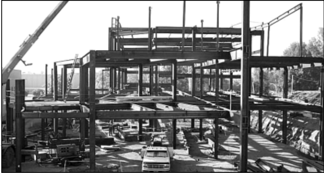
After: Summer 2001