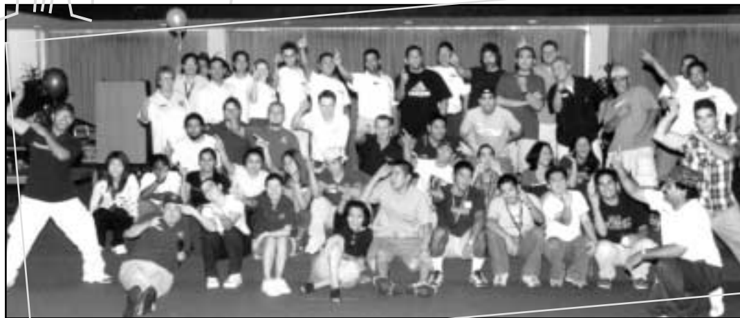
ASI Staff Orientation, "to Infinity and Beyond," in September 2000.

Investing in its future and in the building blocks of its organiza-