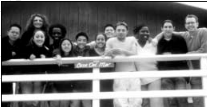
The B.E.A.T at their January mid-year planning retreat.

ASI Bronco Events & Activities Team (B.E.A.T.) , formerly known as ASI Programming Board, hosted nearly 100 events of its own this year and partnered with nearly 50 campus groups on jointly cosponsored. Thousands of students, faculty, staff and community members participated in a wide variety of small to major events.