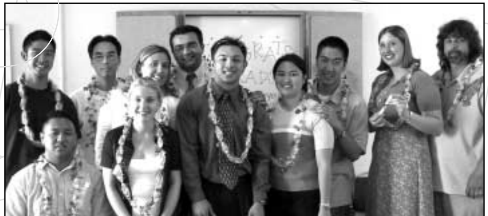
Proud and happy ASI Graduates, members of the Class of 2001