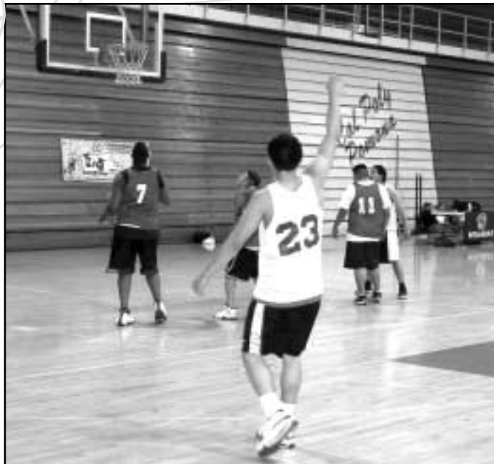
Intramural basketball league participants at the Kellogg Gym.

Recreational Sports reintroduced tournaments to our programs beginning late in the Winter Quarter. Tournaments included racquetball, tennis, three-point shooting Contest and soccer. About 150 participants were served.