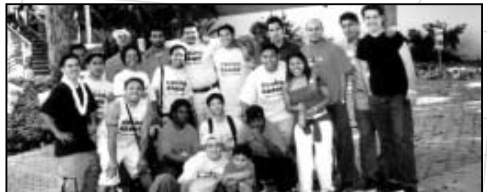
Cal Poly Pomona students come together following the ASI elections.

The leaders of student government were concerned about getting improvements made on campus that would be beneficial to all members of the Cal Poly Pomona community. Improvements such as a one-million dollar allocation for campus lighting to IMPROVE SAFETY and a CREDIT CARD AWARENESS PROGRAM to increase student awareness about the risk of student debt were accomplished.