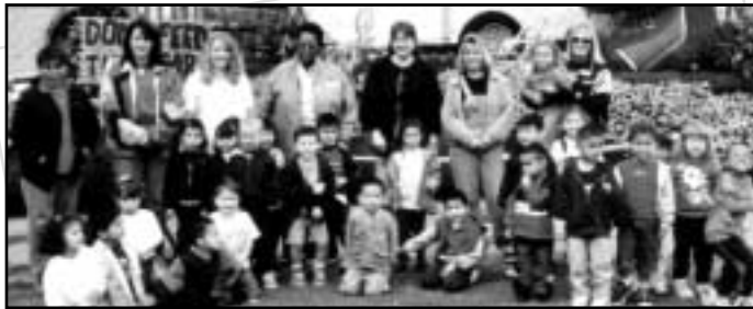
Children's Center teachers and students.

In a continuing partnership between the University and ASI, the Children's Center served students, faculty, staff, alumni and community residents who have children. Offering a developmental program with attention to the individual needs of each child, the Center served more than 100 children during the past academic year. Highlights of the past year include: