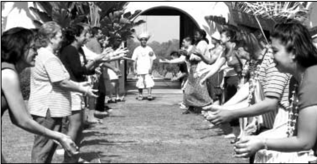
ASI students and staff at "Surf's up at the Beach Shack" in the Union Plaza Courtyard.