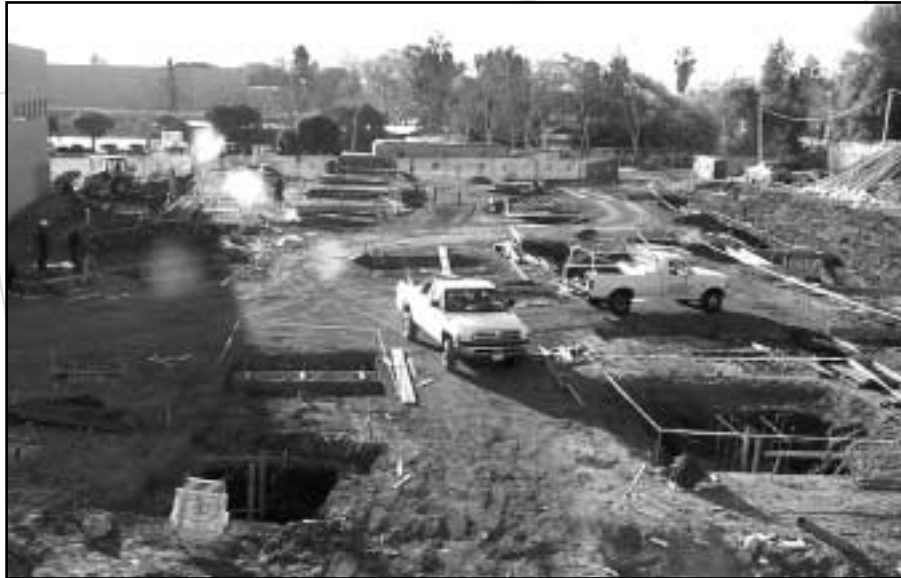
Before: Summer 2000