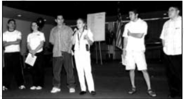
Student officers address ASI staff at the Fall 2000 Orientation program.